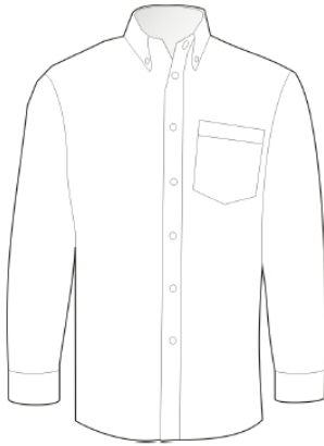
White school shirt (long or short sleeved with top button fastened)