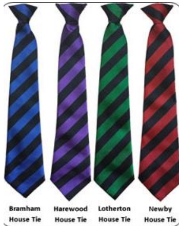
Bramham House Tie Harewood House Tie Lotherton House Tie Newby House Tie