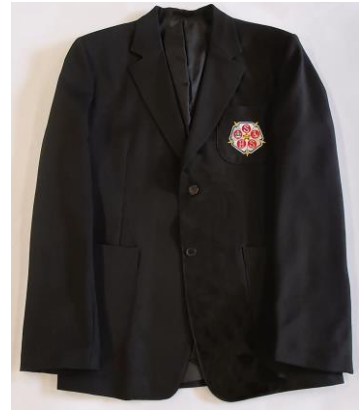
Black Blazer with school badge