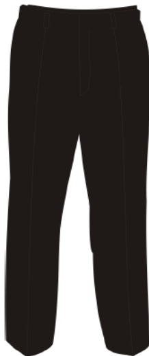
Black, traditional style school trousers